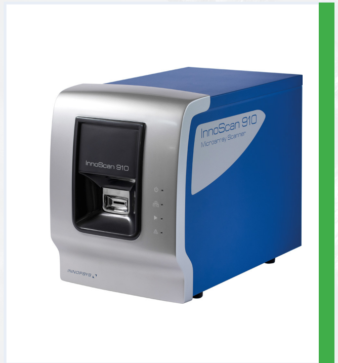
Image acquisition & analysis software

Barcode reader Accurate control of acquired images Scanner supplied with a validation slide which verifies scanner performance